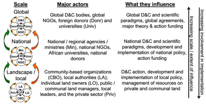
Fig. 2. Roles of the researchers, policy facilitators, and community facilitators in the spanning of boundaries among different actors and what those actors influenced at different scales. D&C, development and conservation; Rs, researchers; PF, policy facilitator; CF, community facilitator.

We then constructed a boundary-spanning team of members, each of whom had a responsibility to span boundaries between institutions at different, nested scales (Fig. 2). At the global level, we asked each of the international scientists on the core team to connect the team’s work with international conservation and development organizations and teams [like the United Nations